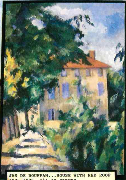
JAS DE BOUFFAN...HOUSE WITH RED ROOF 1885-1886 oil on canvas WHATEVER COMES FROM THE HEART CARRIES THE HEAT AND COLOR OF ITS BIRTHPLACE. ...OLIVER WENDELL HOLMES