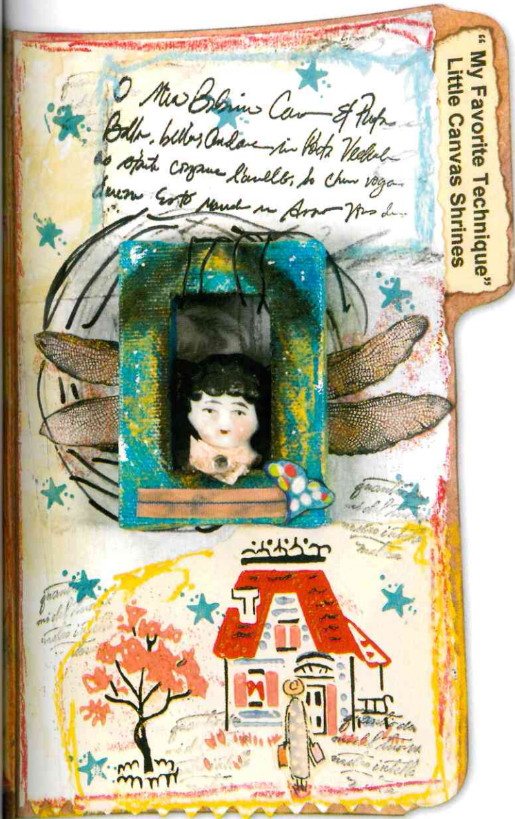
"My Favorite Technique" Little Canvas Shrines